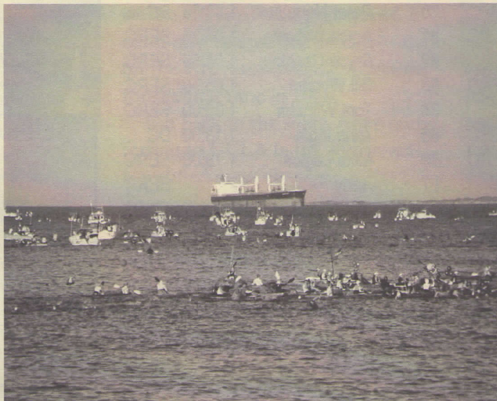
Swimmers and kayakers at the start